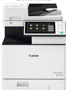
imageRUNNER ADVANCE C475iF III* (Standard Model)